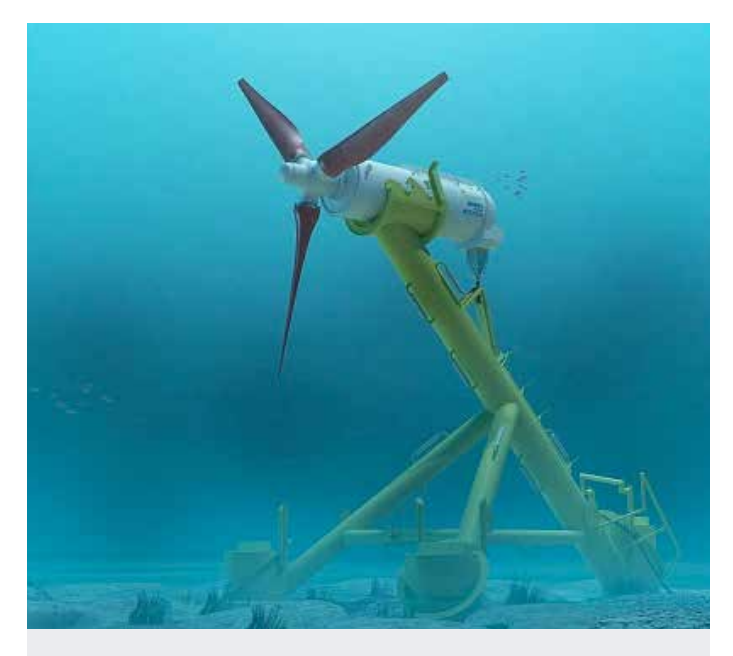
Fixed installation nacelle mounted generator

Whilst tidal technology is continuously evolving, it is still in a nascent stage, thus a single method of power generation has not yet been acknowledged as the most effective. This is an exciting time for developers, who have the opportunity to revolutionise tidal power through innovation.