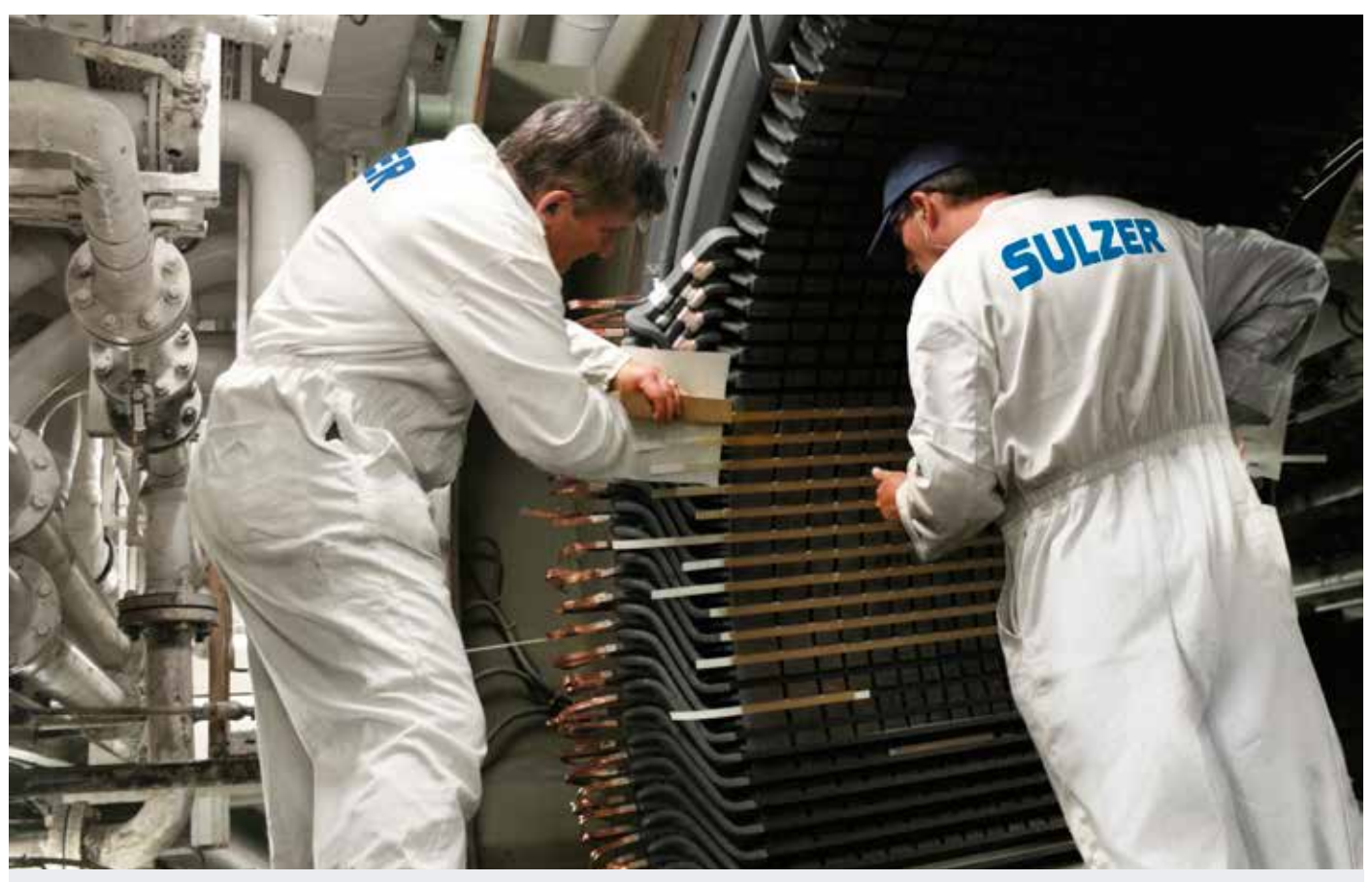
With space on a cruise ship at a premium, the engine room does not afford the same advantages of a purpose built workshop, but nevertheless the team soon had the rotor removed and safely secured.

workshop, but nevertheless the team soon had the rotor removed and safely secured.