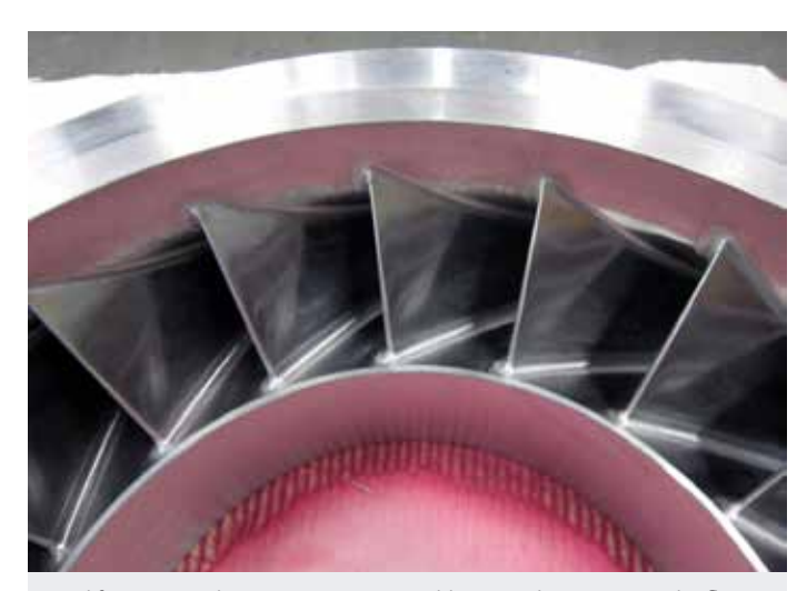
Modifications to the vane geometry would ensure the optimum inlet flow angle which would also improve the mass flow rate (MFR).