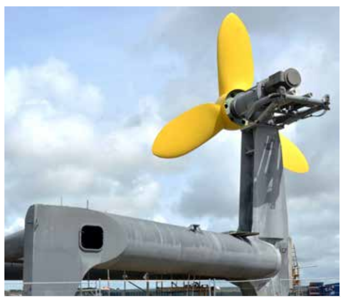
Gravity mounted, direct seawater cooled generator