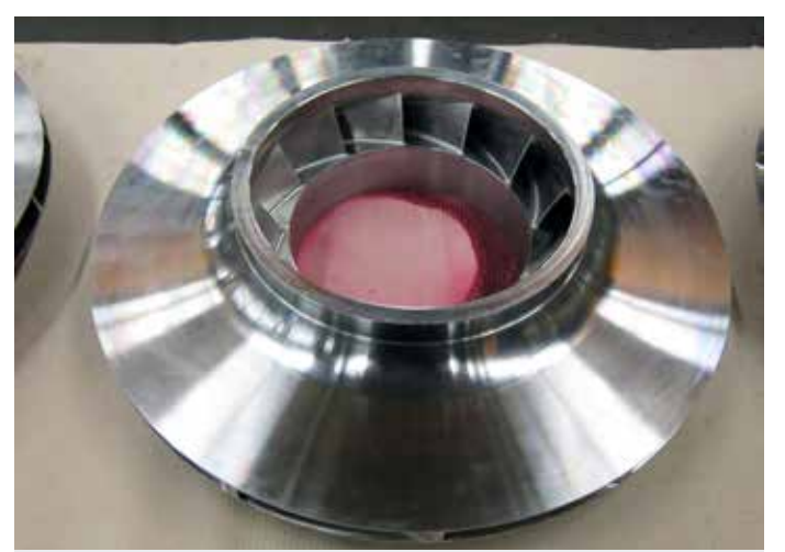
The evaluations showed the most significant performance improvements would be as a result of optimising the four impeller stages.