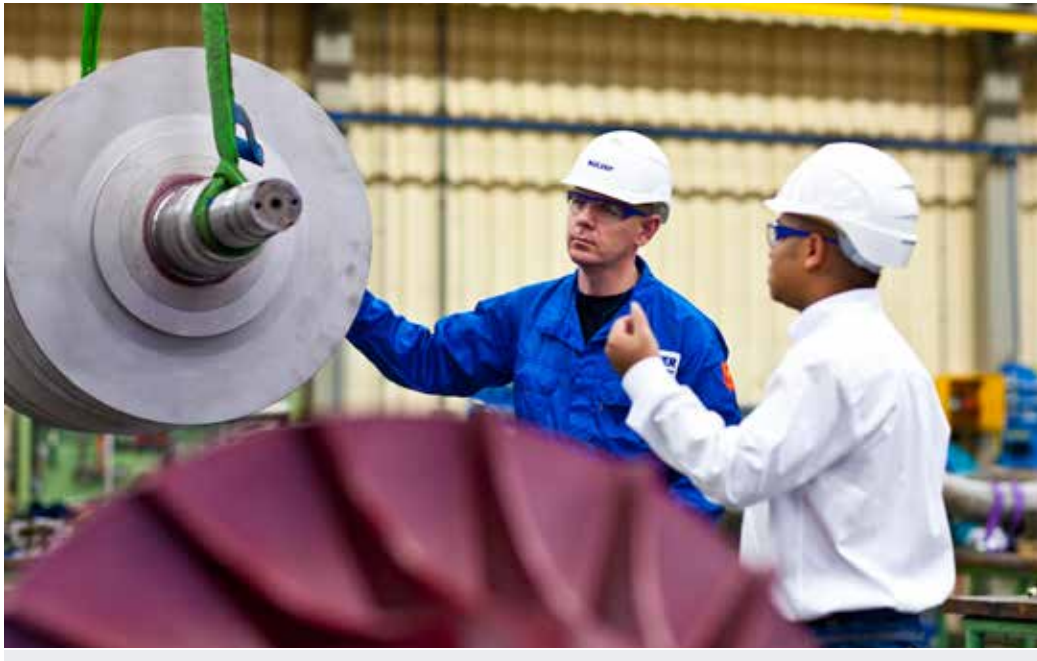
Sulzer was able to offer a complete solution including design, analysis, evaluation and manufacturing from a single source that also proved to be more cost effective than the OEM option

The project was divided into two tasks: the repair of the rotor and the investigation into design improvements that could increase performance and efficiency. By selecting Sulzer, the client gained access to the extensive knowledge and expertise of its engineers with the Rotterdam Service Center providing specialist skills for compressors. The project was managed by the Jänschwalde Service Center to provide the client with coordinated feedback and progress reports.