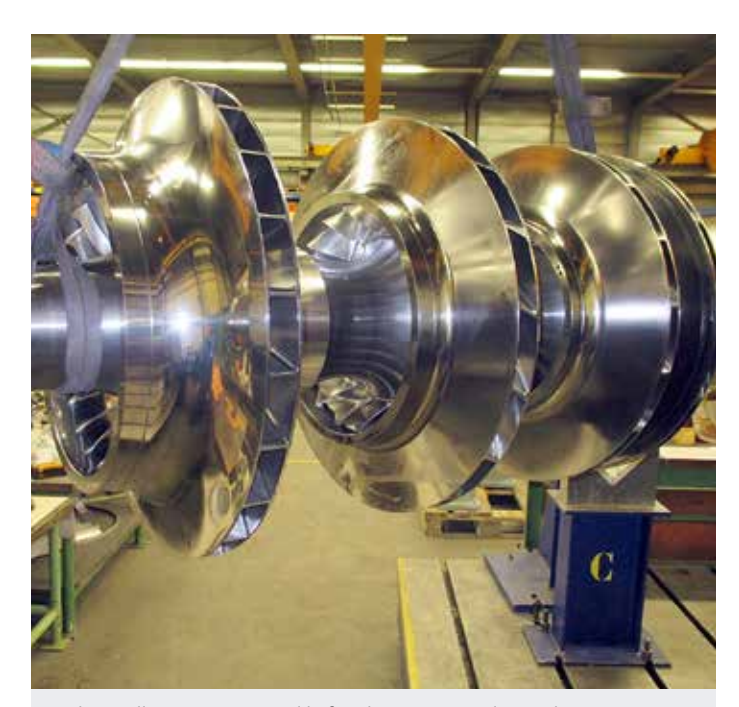
Each impeller was spin tested before being mounted onto the new rotor shaft to ensure the integrity of the impeller construction when operating under load